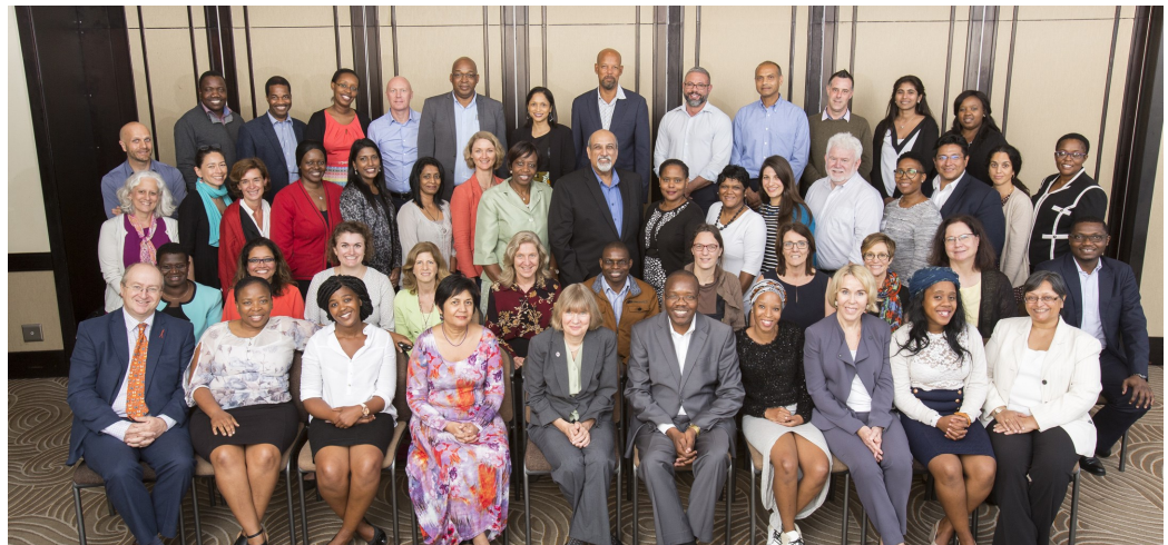
Delegates at the WHO Technical Consultation on HIV Pre-Exposure Prophylaxis for Women and Adolescent Girls held over two days at the Elangeni hotel in Durban.

T he World Health Organisation (WHO) Technical Consultation on HIV Pre-Exposure Prophylaxis for Women and Adolescent Girls brought together public health and clinical experts at a two-day meeting in Durban on 27-28 September.